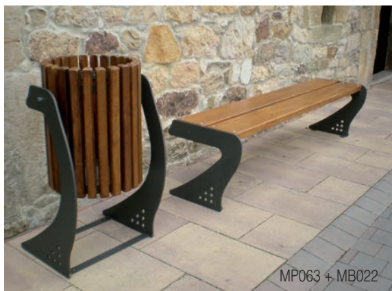
MP063 + MB022

MB023: 25 kg. Silla / seat / chaise / cadeira.