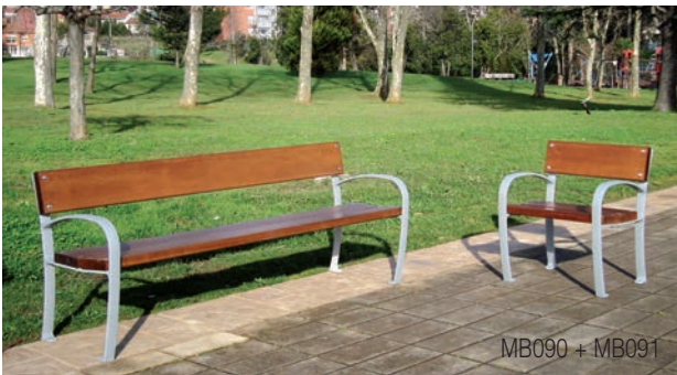
MB090 + MB091

MB091: 22,3 kg. Silla / seat / chaise / cadeira.